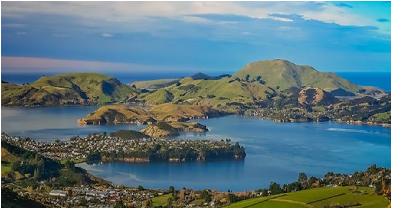
Image of Otago Peninsula